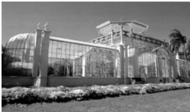
Adelaide's Botanical Gardens

The Gallery of South Australia is also well worth visiting as is the State Library, The Adelaide Oval (cricket ground) and St Peter's Cathedral. For those who want to move out of the city and/or taste South Australian wine, there is a day tour of the Barossa Valley. If you'd prefer to stay closer to the city a tram trip to Glenelg makes a nice seaside break.