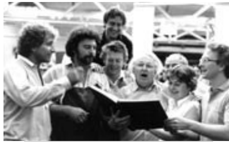
Wolfgang Wagner with a Bayreuth cast of happier times

When the final curtain fell, in the split second before the audience could respond in general, someone yelled out 'Kitsch!', and this was followed by a tumult of booing (this had already started at the end of Act 1) which then found itself