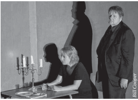
Nina Stemme (Isolde) & Ben Heppner (Tristan)