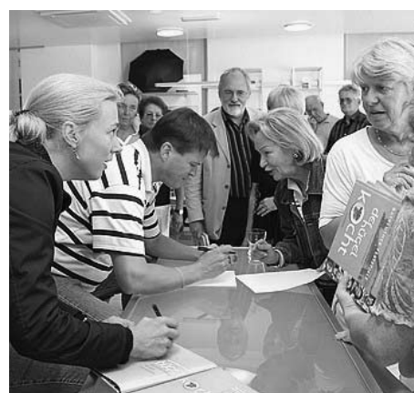
Christian Thielemann and Katherina Wagner sign copies of Der Hügel Kocht at the launch.